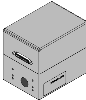
SCANcube IV 14