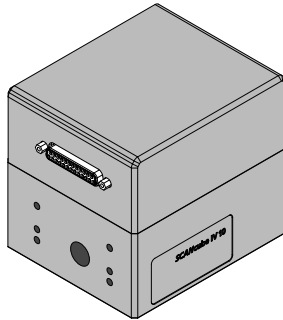
SCANcube IV 10